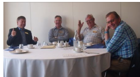
A couple of the teams ...