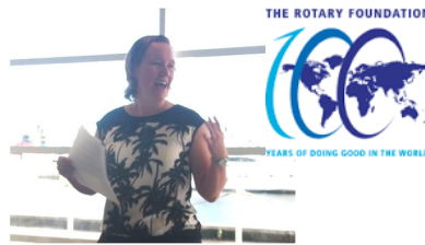
testing our knowledge of Rotary Foundation in this, its 100 th year.