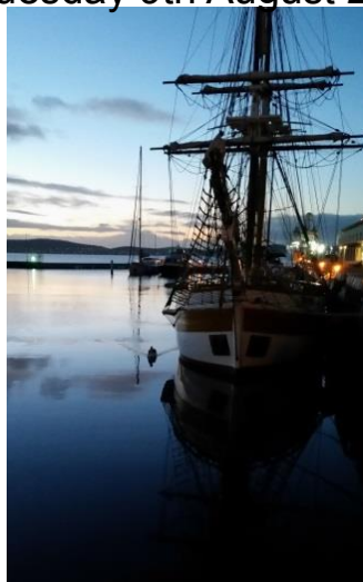
A Pelican visitor

Warwick Pease from Hobart City Central Rotary Club