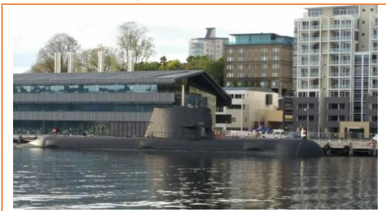
HMAS Dechaineux. Collins class submarine