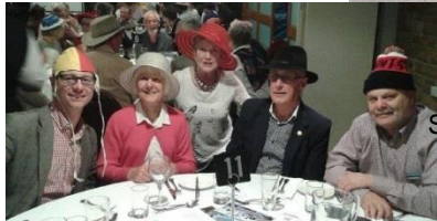
Hat Day Quiz with Sandy Bay Rotary