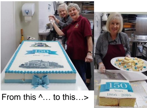
From this ^... to this...>