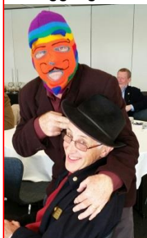
The bogey-man and the Bookie!

LAST WEEK: Hat Day for Mental Health Many of us wore hats, and none were outrageous, to support and remember to look out for others among us who may be struggling.