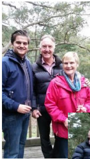
Drinks at the Waterworks