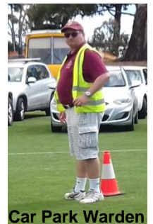
Car Park Warden

Stewards' duties: S1: Cash Collector, Record apologies/make-ups