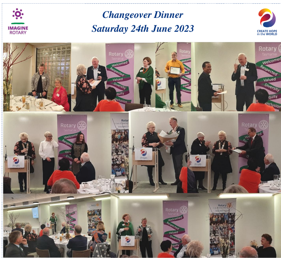
Changeover Dinner Saturday 24th June 2023